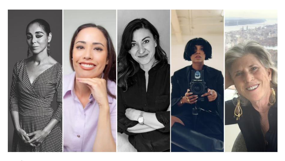
40th Annual Infinity Awards 2024