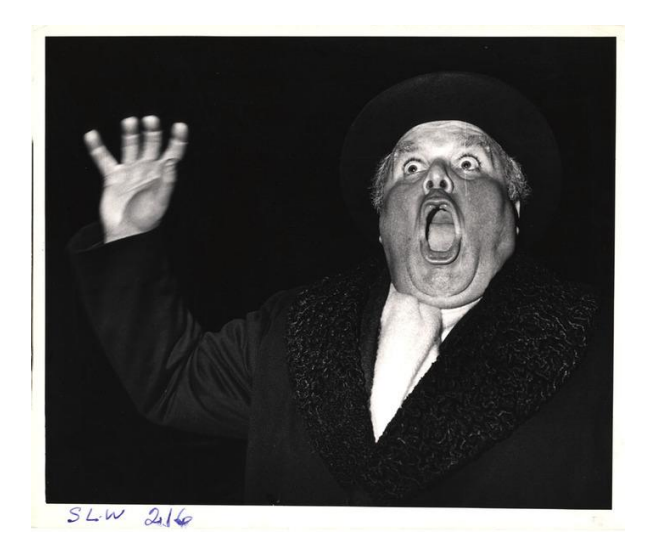
ICP at 50: From the Collection, 1845–2019

The first exhibition by recent graduates from The School at ICP to run for a full exhibition cycle, this show includes work by more than 70 students from over 25 countries, from Argentina to Belarus and Thailand to Yemen. On view will be images from graduates of four of ICP's education programs: the full-time, onsite One-Year Certificate Programs in both Creative Practices and Documentary Practice and Visual Journalism, the 2023 One-Year Certificate class from the Documentary Practice: Visual Storytelling Online program, and the Teen Academy Imagemakers program.